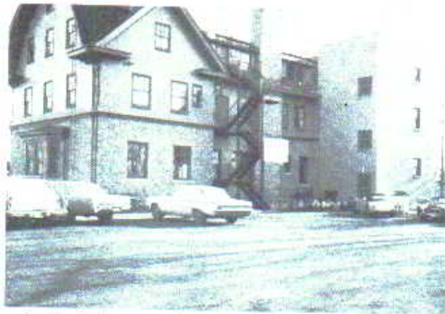
Back of house with new fire escape, fire tower and large parking lot.