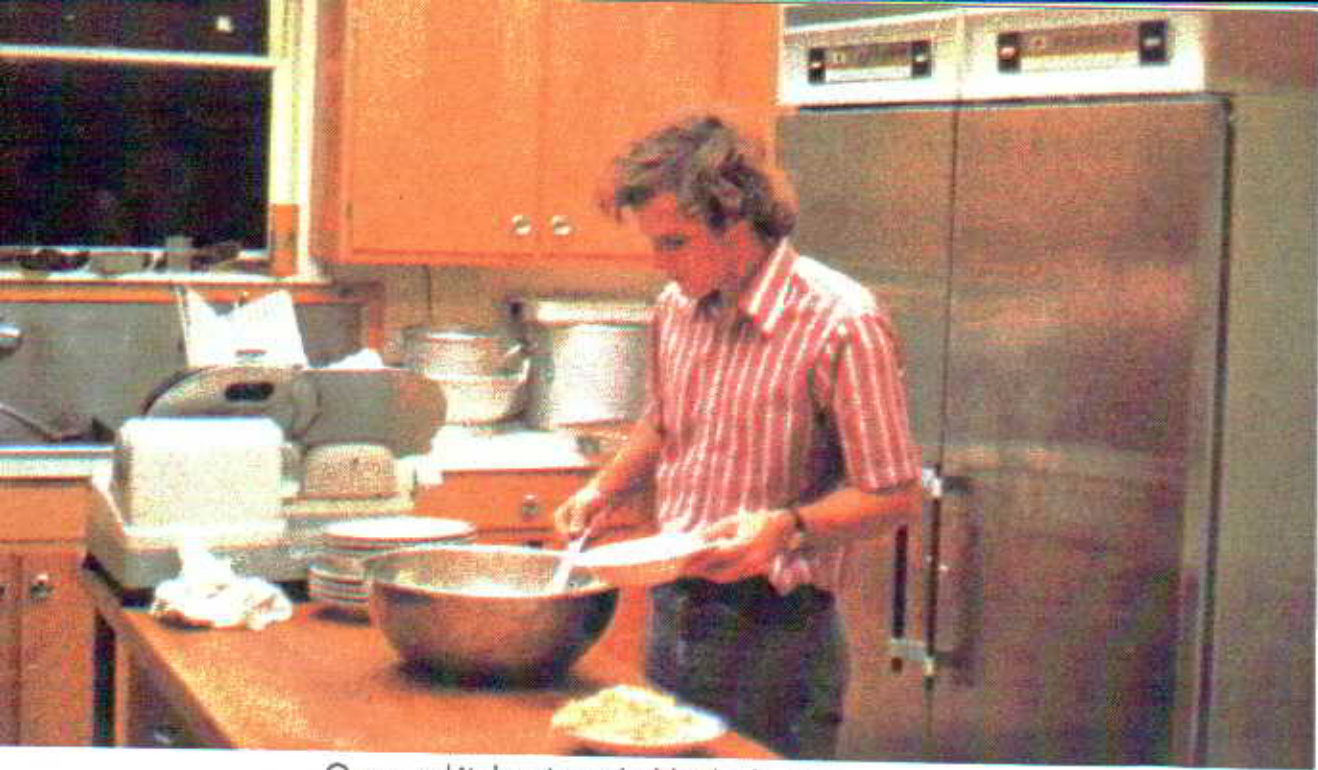
Our new kitchen is probably the best on campus