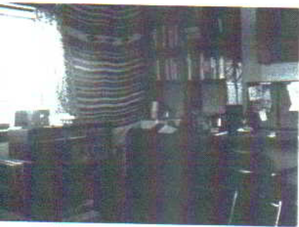
The new 3rd floor single